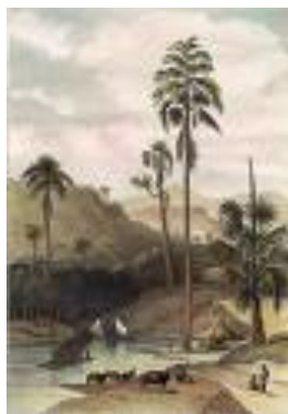
India, mid 19 th Century

West Hartford, Connecticut Fall 2009 Tickets: cabotix.com Information (860) 722-2300